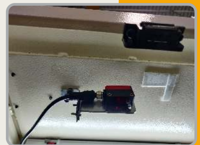
Photo sensor stop motion for yarn cut