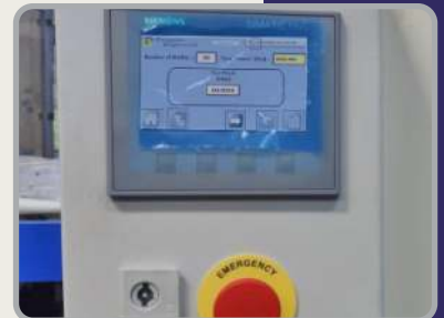
Human Machine Interface