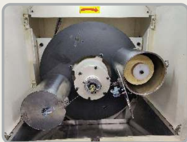
Stainless Steel Yarn cover to avoid entanglement at high speed